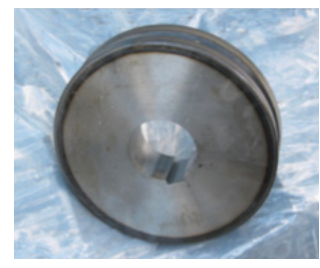
Idler Wheel & Tail Wheels